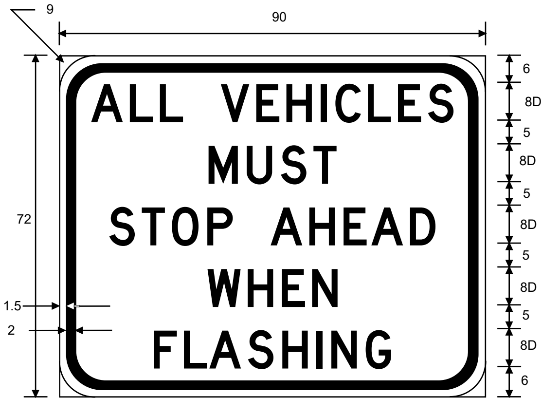
R13-2T ALL VEHICLES MUST STOP AHEAD WHEN FLASHING