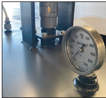
Thermostat control and probe placement accurately controls temperatures