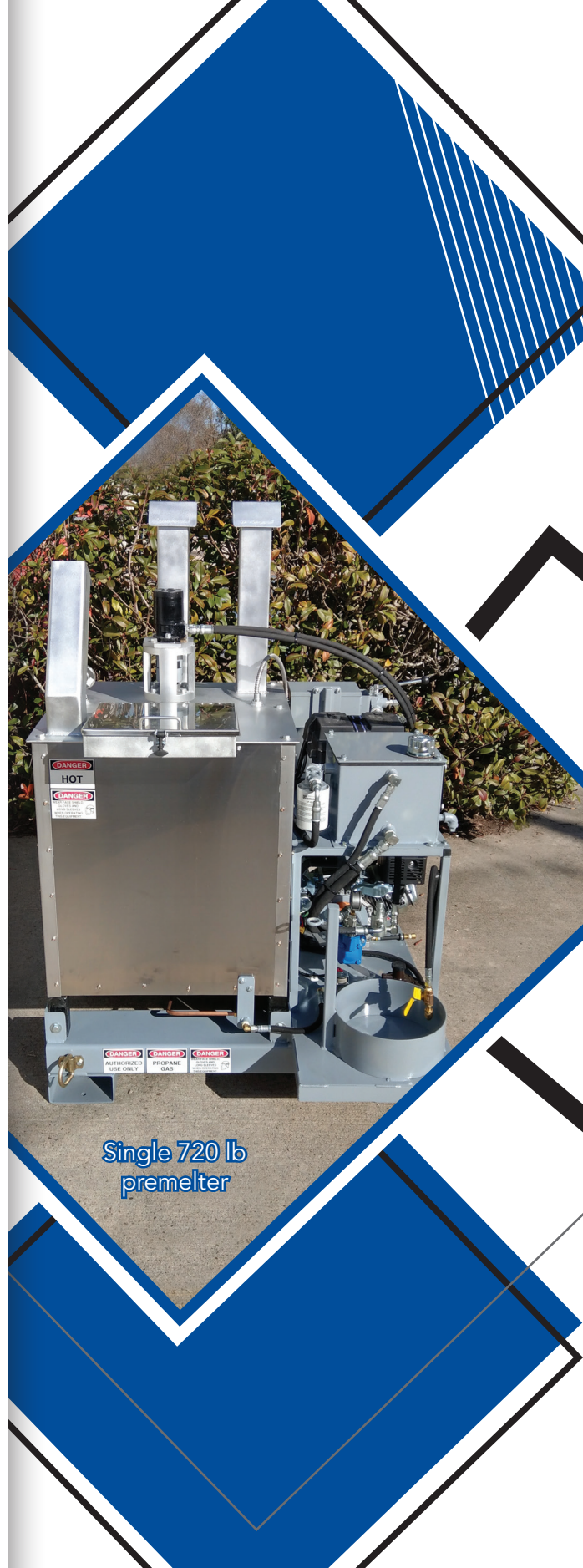
Single 720 lb pre-melter

lowest cost per pound of any melter in the industry