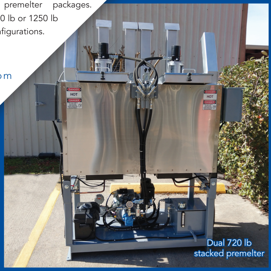
Dual 720 lb stacked premelter