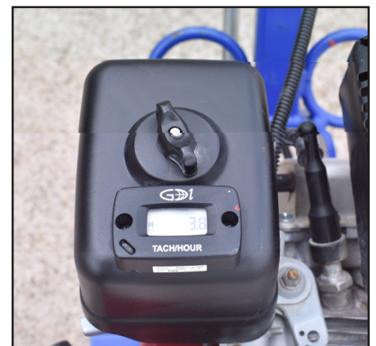
add textual info here