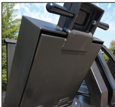
Flash-safe material feed doors prevent injury to operator