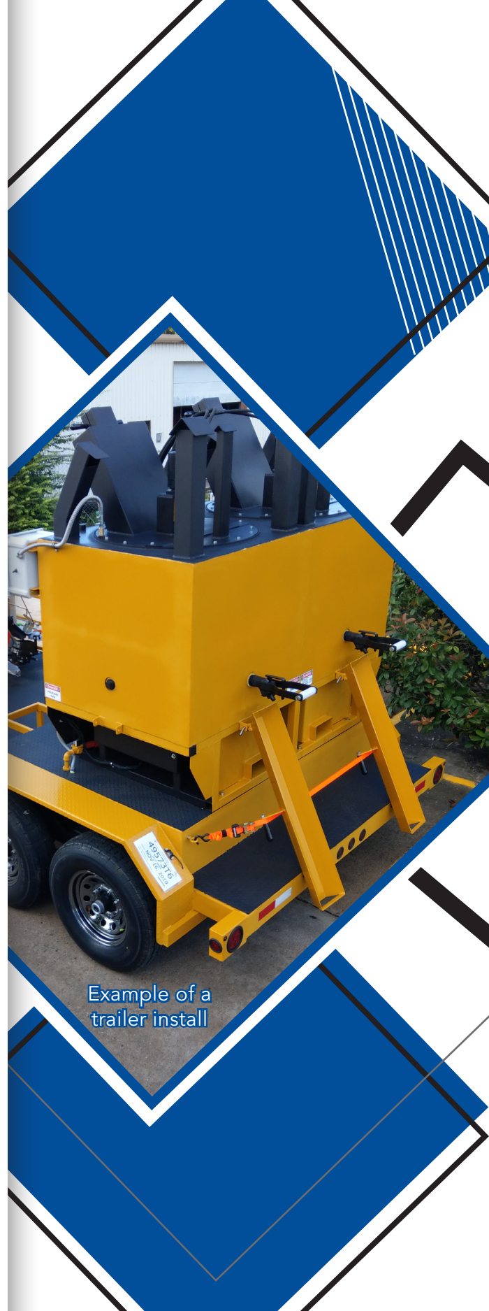
Example of a trailer install

A Transline Industries Company • www.translineinc.com • sales@translineinc.com