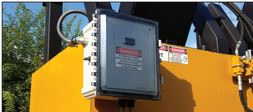
Digital thermostats with automatic spark ignition systems allow burners to be ignited with a simple toggle switch