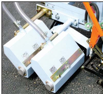
Optional double-drop glass bead system