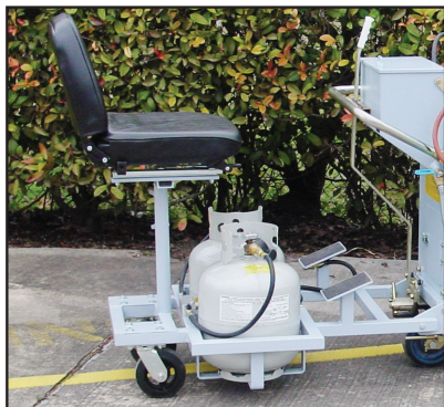
Optional sit-down sulky available