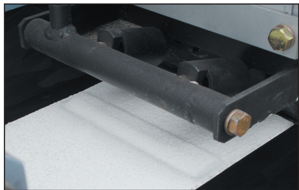
Profile thermoplastic extrusion

A Transline Industries Company • www.translineinc.com • sales@translineinc.com