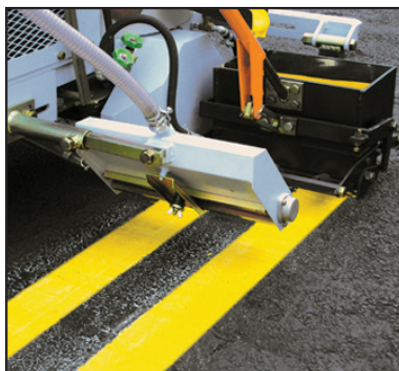
Change die size in seconds without the use of tools