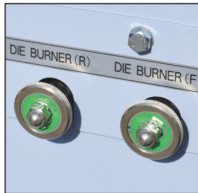
Conveniently located die burner controls