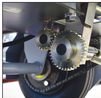
Positive direct-drive bead dispense — no frictional wheels