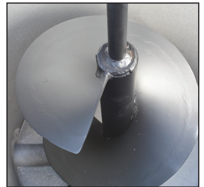
14" auger agitation with bottom blade