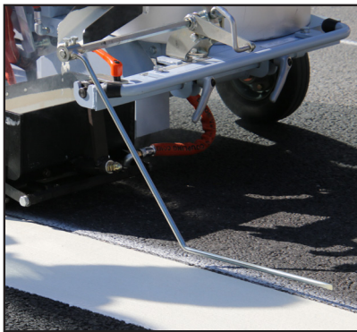
Unique lever allowing operator to raise and lower the pointer