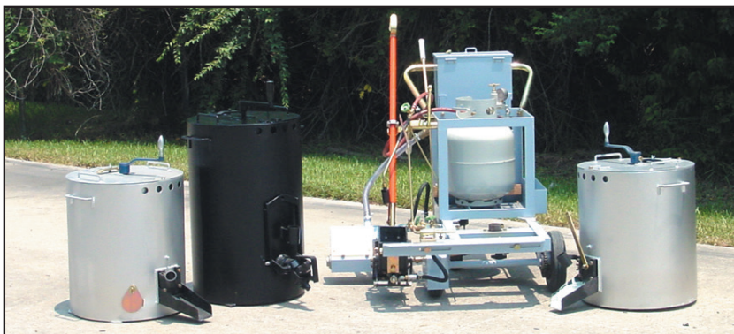
Optional second color tank or bitumen tank can be swapped in seconds.