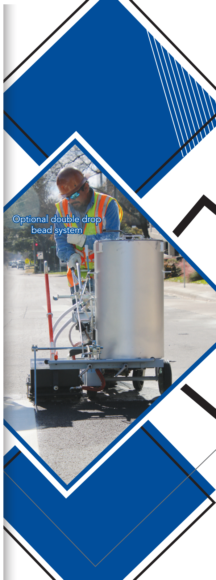
Optional double drop bead system

A Transline Industries Company • www.translineinc.com • sales@translineinc.com