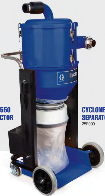
CYCLONE LP SEPARATOR 25R090