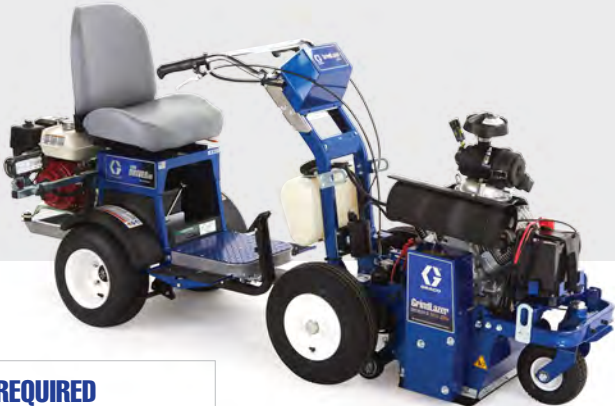
LineDriver HD 262005