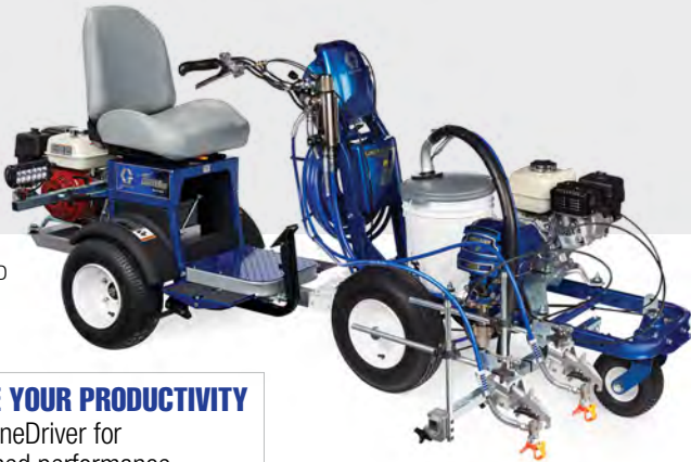
LineDriver HD 262005