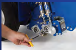
1) Remove screw

SWAP OUT THE BLADE IN SECONDS – KEEPS YOU UP AND RUNNING ON THE JOB!