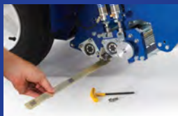
2) Swap out blade