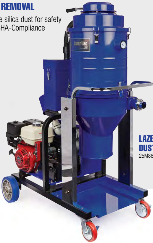
LAZERVAC™ 550 DUST COLLECTOR 25M860

Remove silica dust for safety and OSHA-Compliance