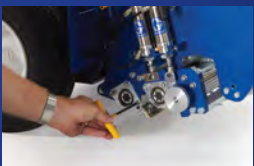
3) Reinstall screw