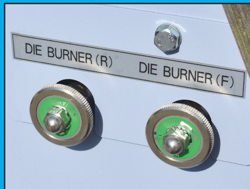
Operator located die burner controls.