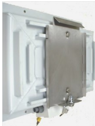
The front bracket attaches permanently to the radar speed sign.