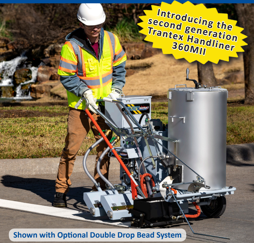
Shown with Optional Double Drop Bead System

Introducing the second generation Trantex Handliner 360MII